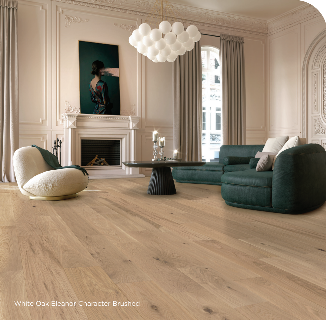
White Oak Eleanor Character Brushed