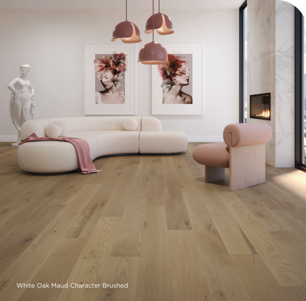
White Oak Maud Character Brushed