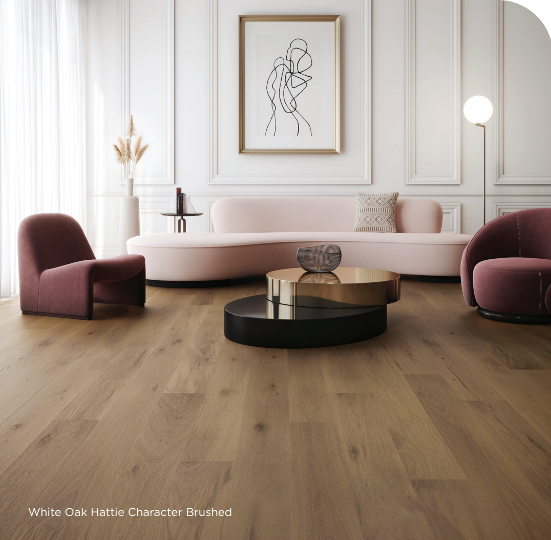
White Oak Hattie Character Brushed