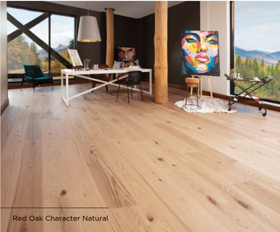
Red Oak Character Natural

The grade is a way to classify wood planks according to natural color variation and the presence of knots, splits, and other character marks. It refers only to the visual aspect of wood. Generally speaking, there are three main grades: Select and Better, Exclusive and Character.