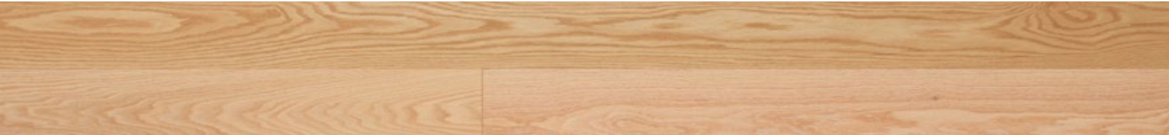
Red Oak Exclusive