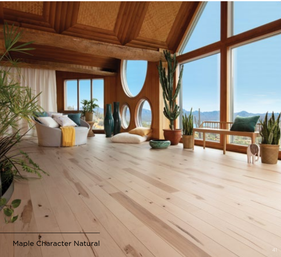
Maple Character Natural