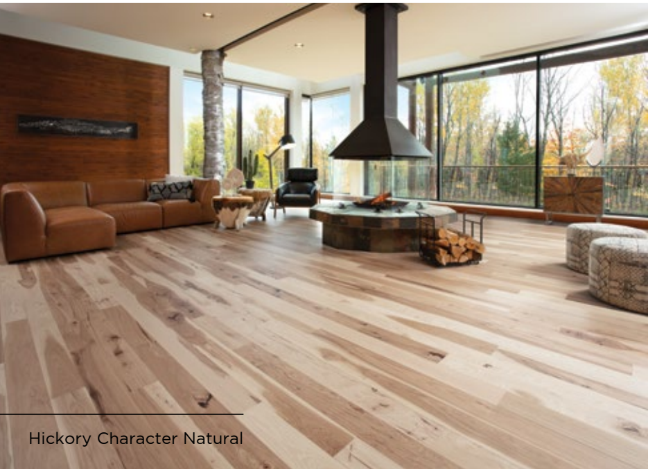
Hickory Character Natural

The actual look and color of a species may vary from what appears in this document. We cannot guarantee that all character marks and color variations will be represented on a small sample.