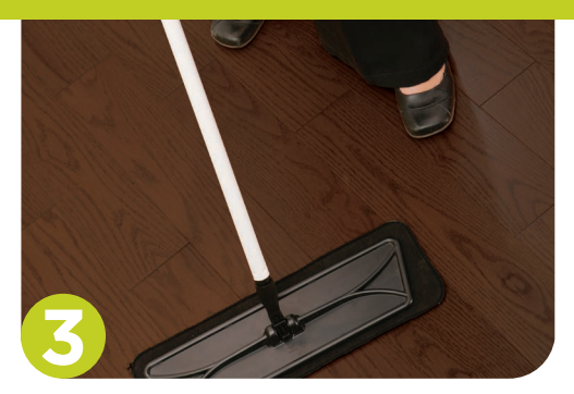
Swiftly wipe the floor surface with the mop, using a to-and-fro motion across the length of the floorboards. Finish cleaning one section before starting on a new area of the floor.

Lightly spray the cleaner on the mop cover.