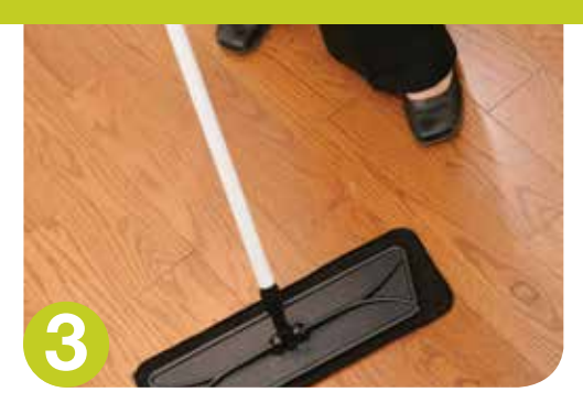
Swiftly wipe the floor surface with the mop, using a to-and-fro motion across the length of the floorboards. Finish cleaning one section before starting on a new area of the floor.

Lightly spray the cleaner on a section of the floor or on the mop cover.